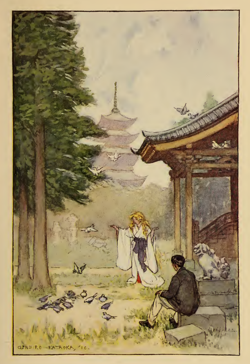
TAMA AT THE TEMPLE TOKIWA