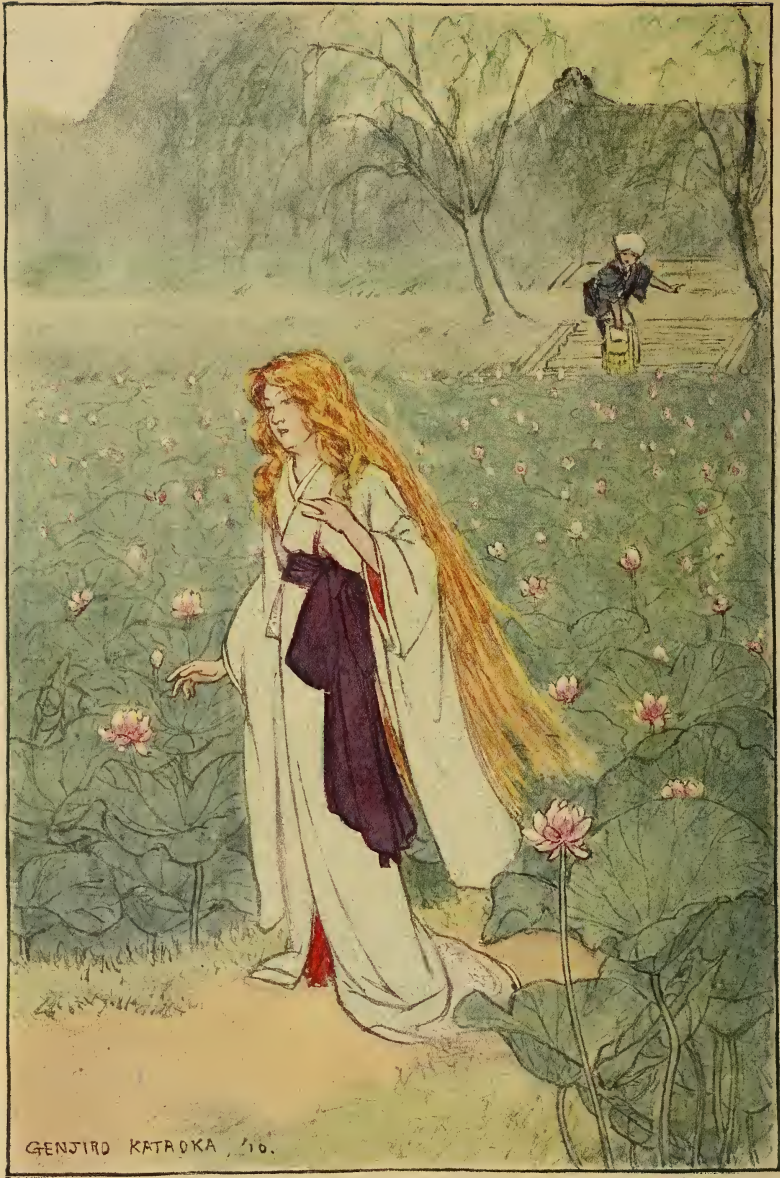
[See page 80